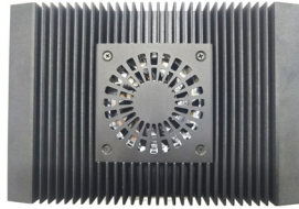
i7-1255U / i5-1235U SKU with System FAN