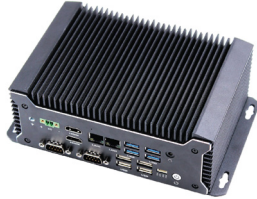
i3-1215U SKU FANLESS BOX-PC